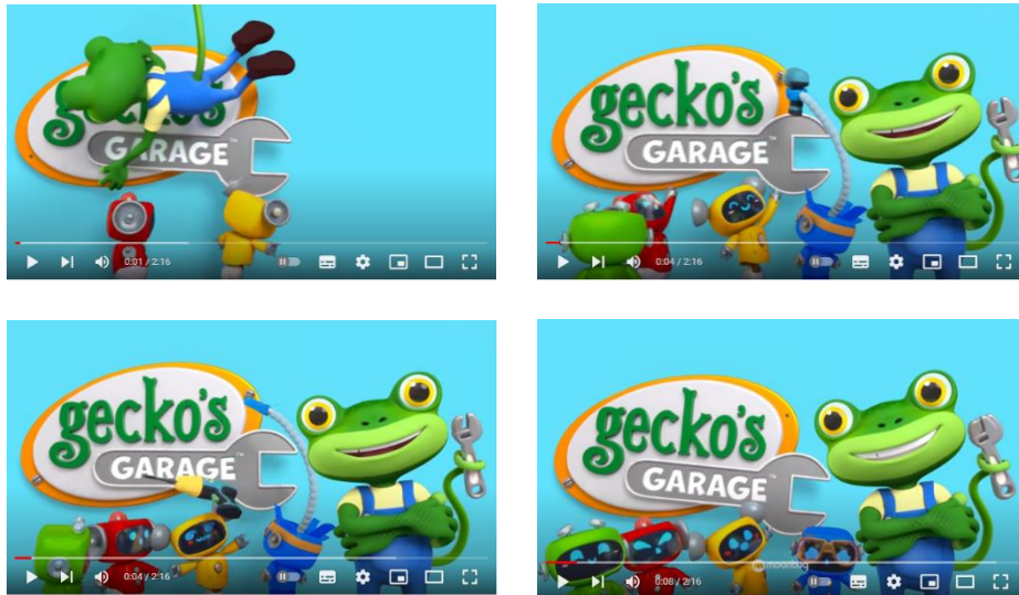
Picture 4. Scene Opening