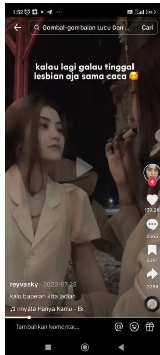
Picture I.1 Capture Lesbian Content in TikTok