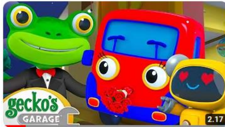
Picture 3. Thumbnail Video