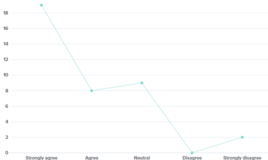
Figure 3. Number of responses to the question “The Green March is more relevant today than it was 10 years ago.”

Accordingly, it is manifest that there is the belief that the majority believe that the Green March is even more relevant and important in modern-day Morocco than it was 10 years ago, albeit with a not insignificant minority indicating that they were neutral in response to this statement. There were very few responses indicating a dissenting opinion.